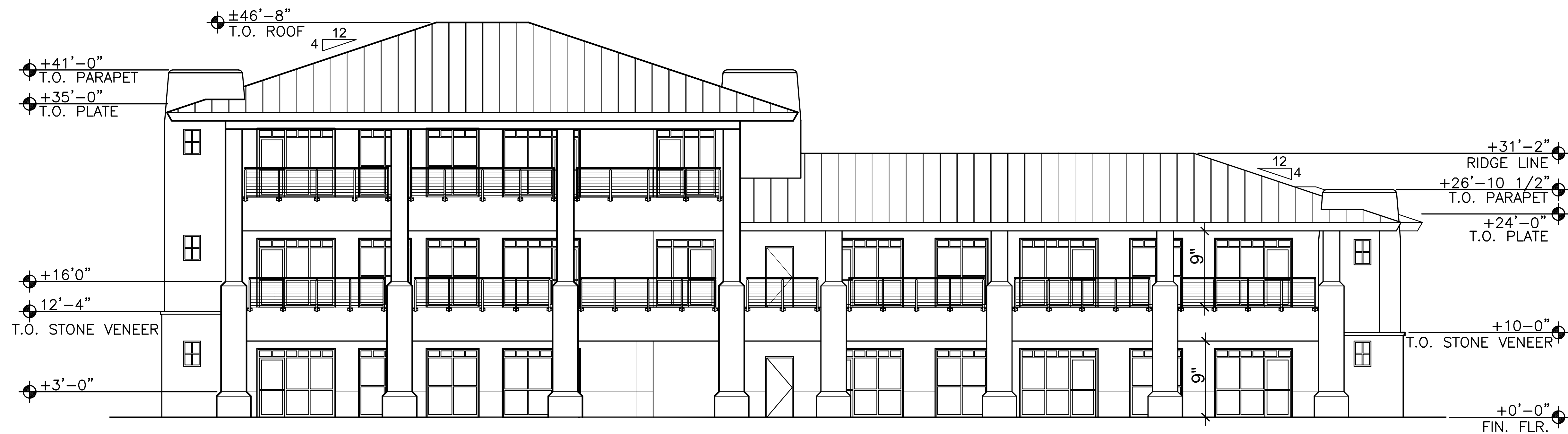
BUILDING 'A' SOUTH ELEVATION (N.T.S.)